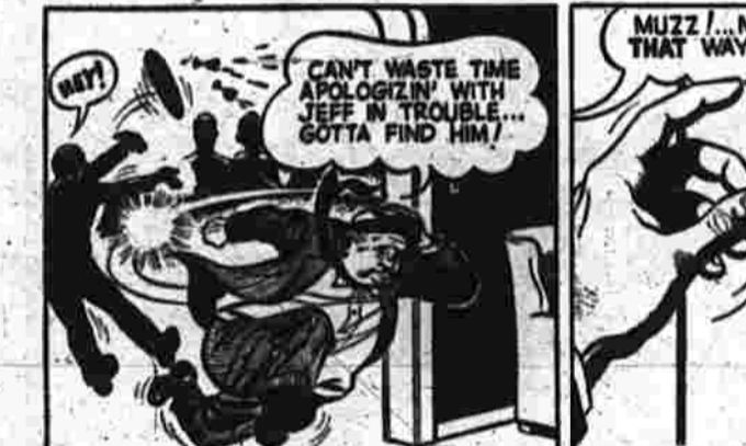
CAPTAIN EASY BY LESLIE TURNER